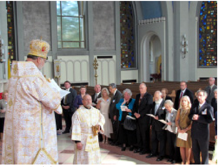
Jubilarians renewing marriage vows.