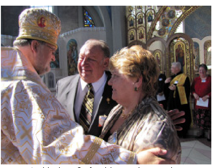
Archbishop Stefan blesses the couples.

Watch videos and see pictures from the Anniversary Celebration on our blog at