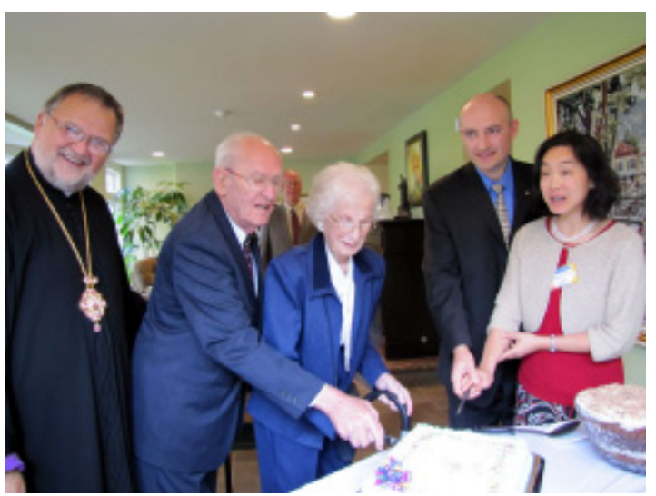
Jubilarians cutting the cake.