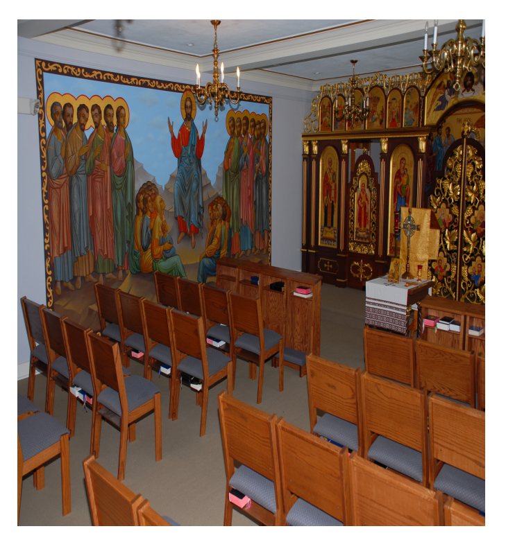
Chapel of St. Josaphat Ukrainian Catholic Seminary Washington, DC