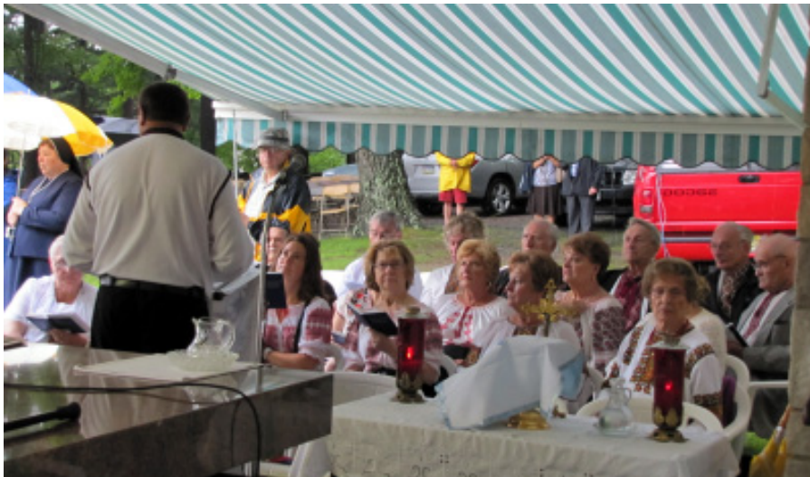
Choir: St. Josaphat Ukrainian Catholic Church, Rochester, New York