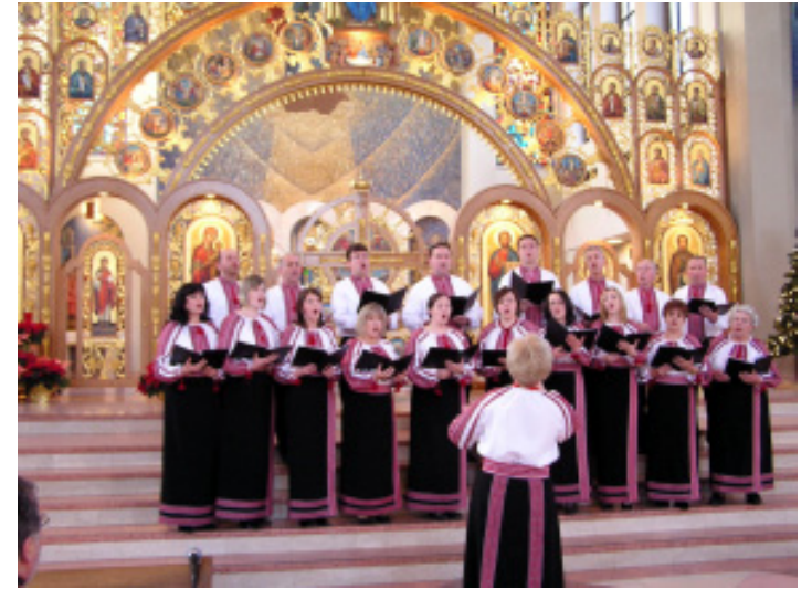
Choir from the Assumption of the BVM parish, Perth Amboy, NJ