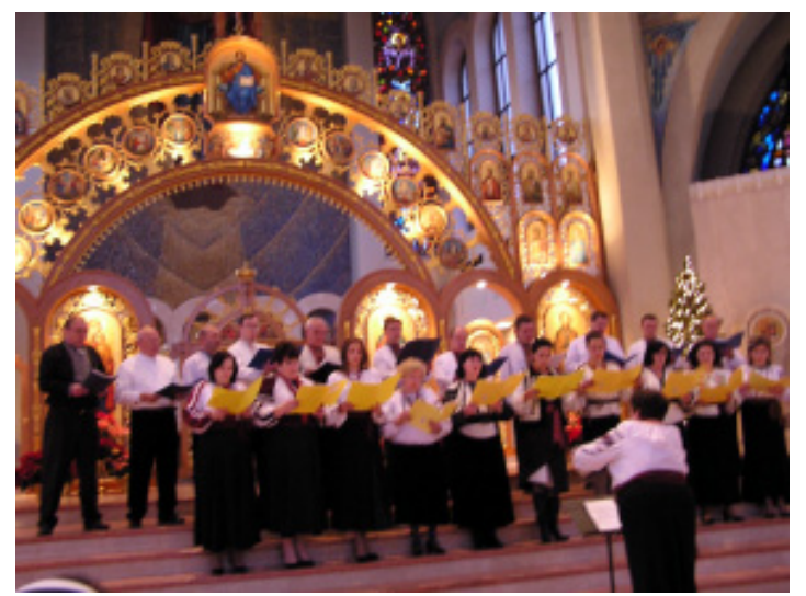
Choir from St. Michael parish, Jenkintown, PA