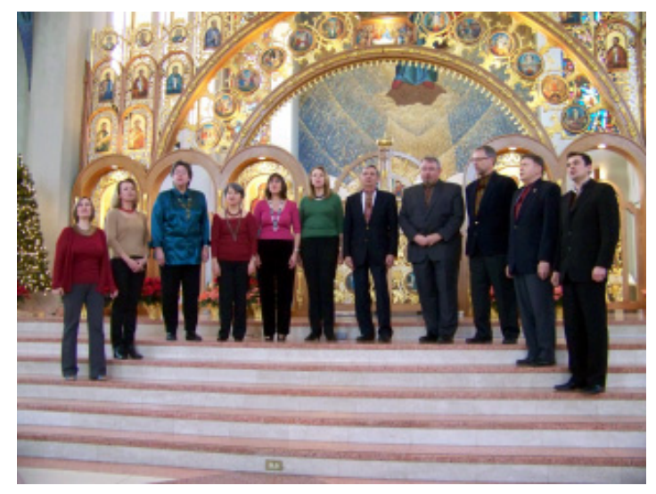
Choir "Living - SONG", Washington, DC