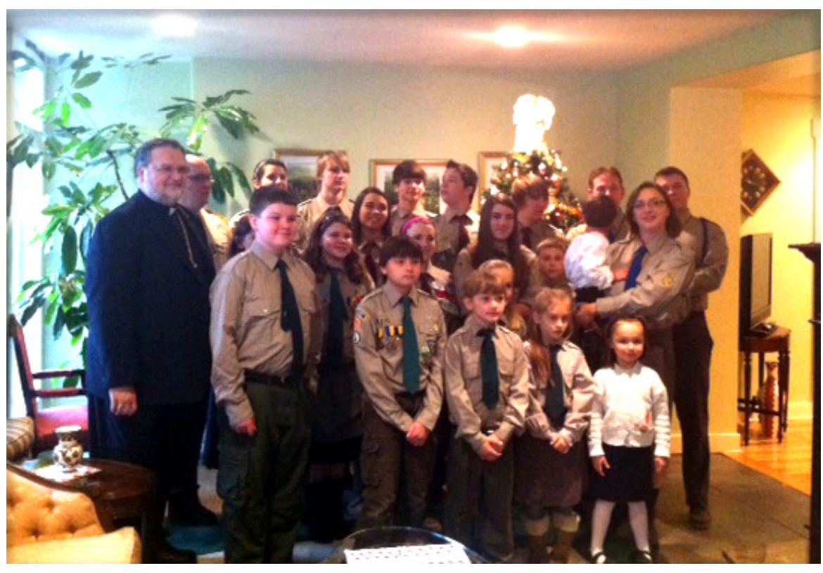
CYM Carolers (December 27, 2011)