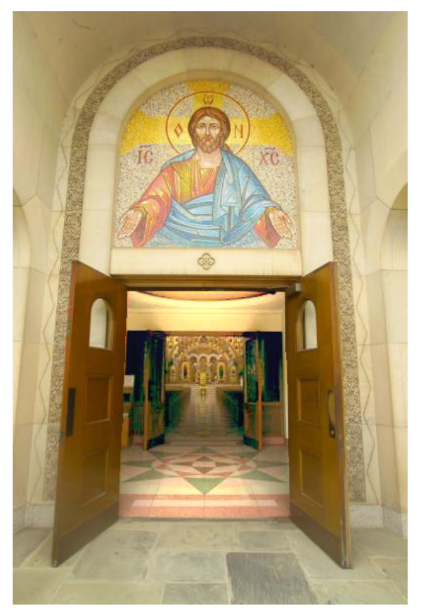
Front Entrance to the Ukrainian Catholic Cathedral of the Immaculate Conception, Philadelphia, PA