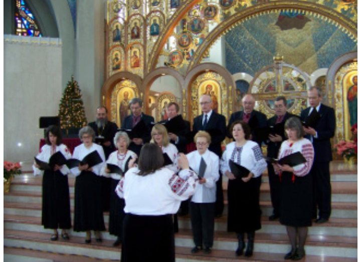
Alexander Koshetz Choir of St. Volodymyr's Ukrainian Orthodox Cathedral, Philadelphia, PA