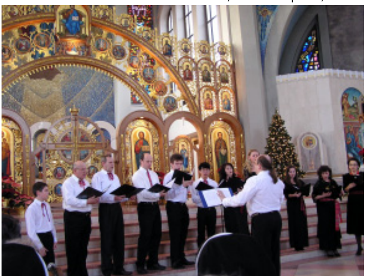
Leopolis Consort of The Ukrainian Music Institute of America (New York branch)