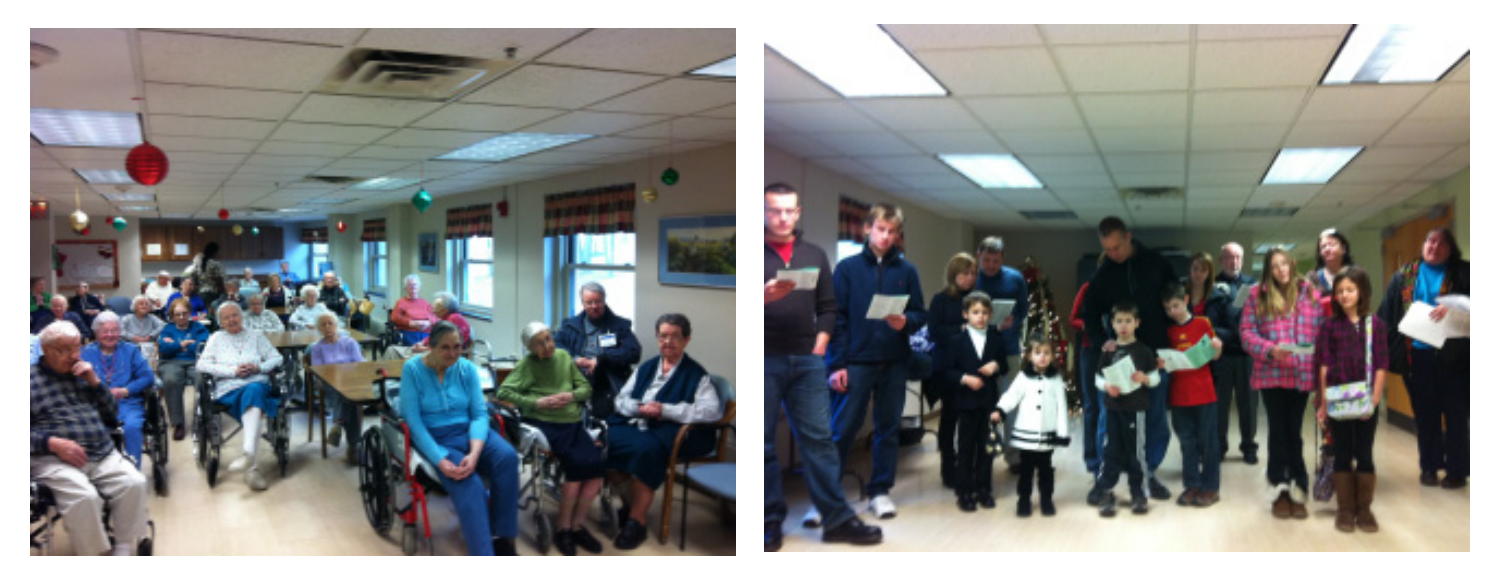
Hillside , NJ parish youth carol in Ukrainian and English to retired Roman Catholic Sisters of Mercy and clergy in Watchung , NJ .