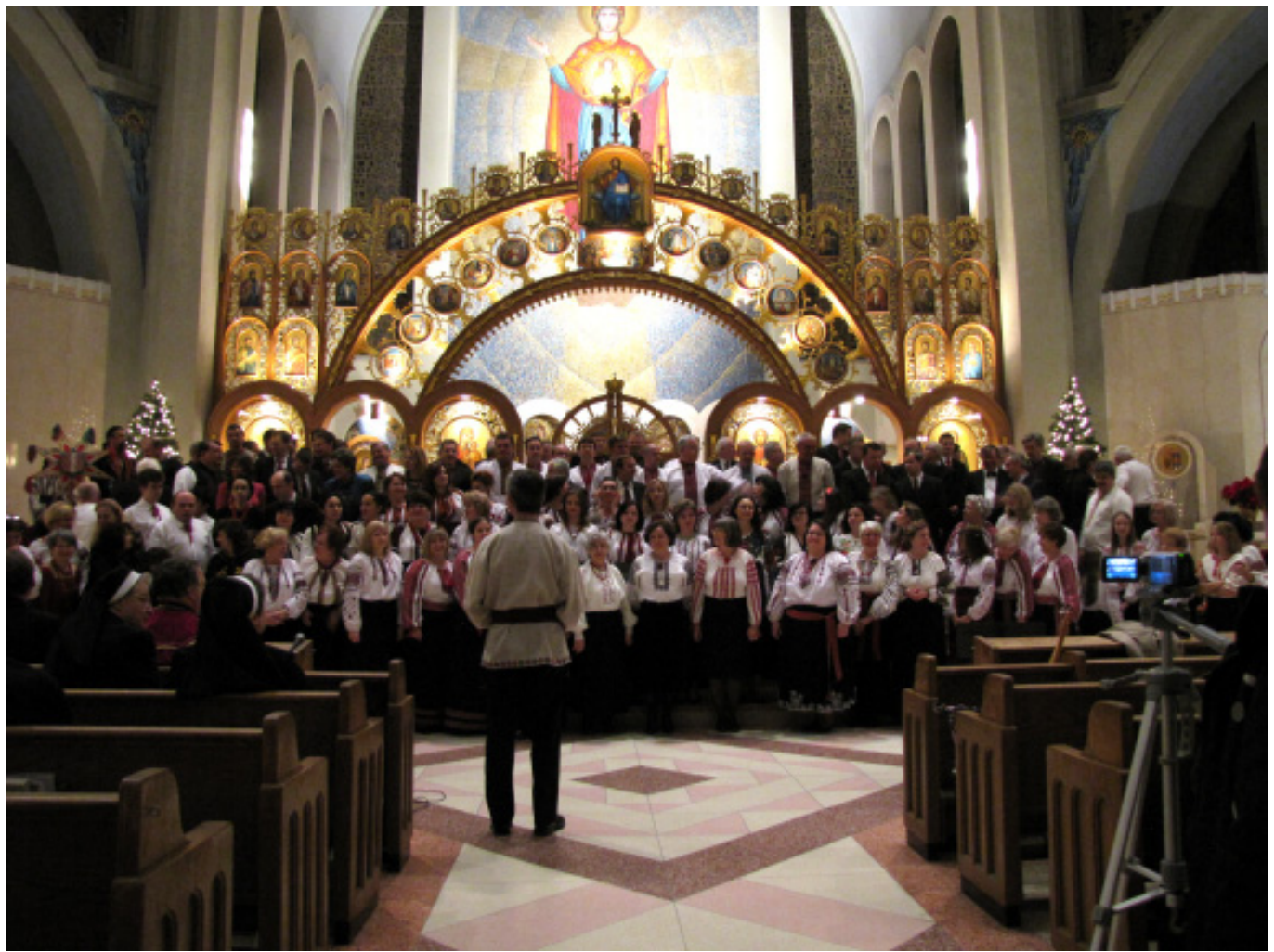
Combined Choir Finale