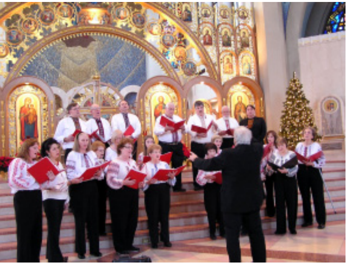
Choir from Ss. Cyril and Methodius parish, Olyphant, PA