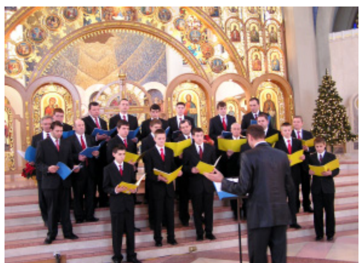
Male Choir of Ukrainian Baptist Church, Philadelphia, PA January 22, 2012