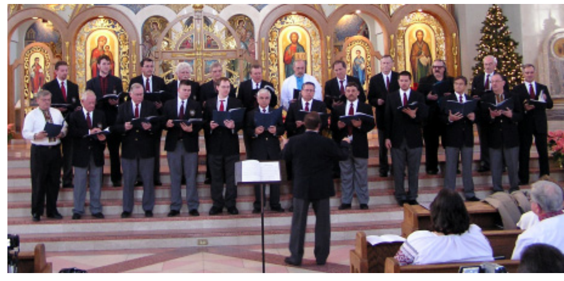
Male Choir "Prometheus", Philadelphia, PA