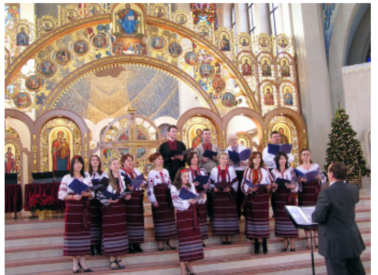
Choir from St. Josaphat parish, Trenton, NJ