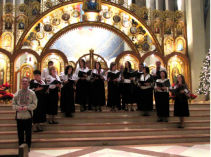
Chamber Choir "Accolade", Philadelphia, PA