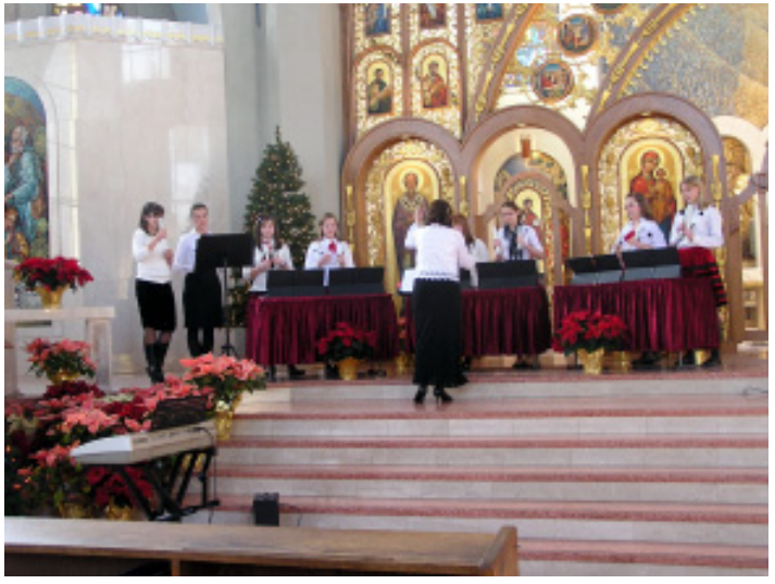
Children's Group "Kamertony" of Ukrainian Baptist Church, Philadelphia, PA