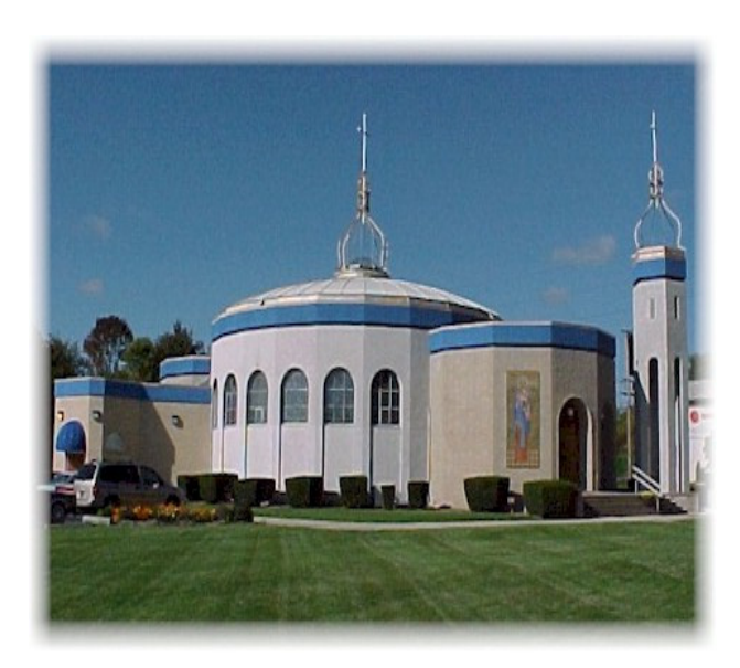
Side view of St. Nicholas Ukrainian Catholic Church Wilmington, DE