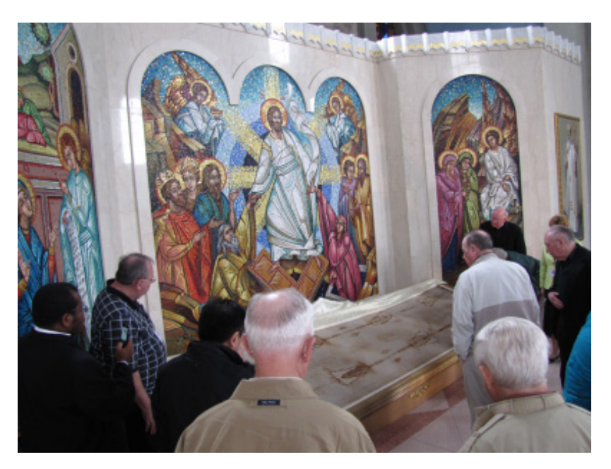
After the Liturgy, participants viewed the replica of the Shroud of Turin at the Cathedral.

faithful? Ongoing education and formation is something which I am confident that you will agree is lacking. I urge you to address the congregation of the Church with such words of information and encouragement. Do it with humility, with charity, and with much passion. I am confident that we will all come to witness miracles of advancement within our Church beyond our expectations.