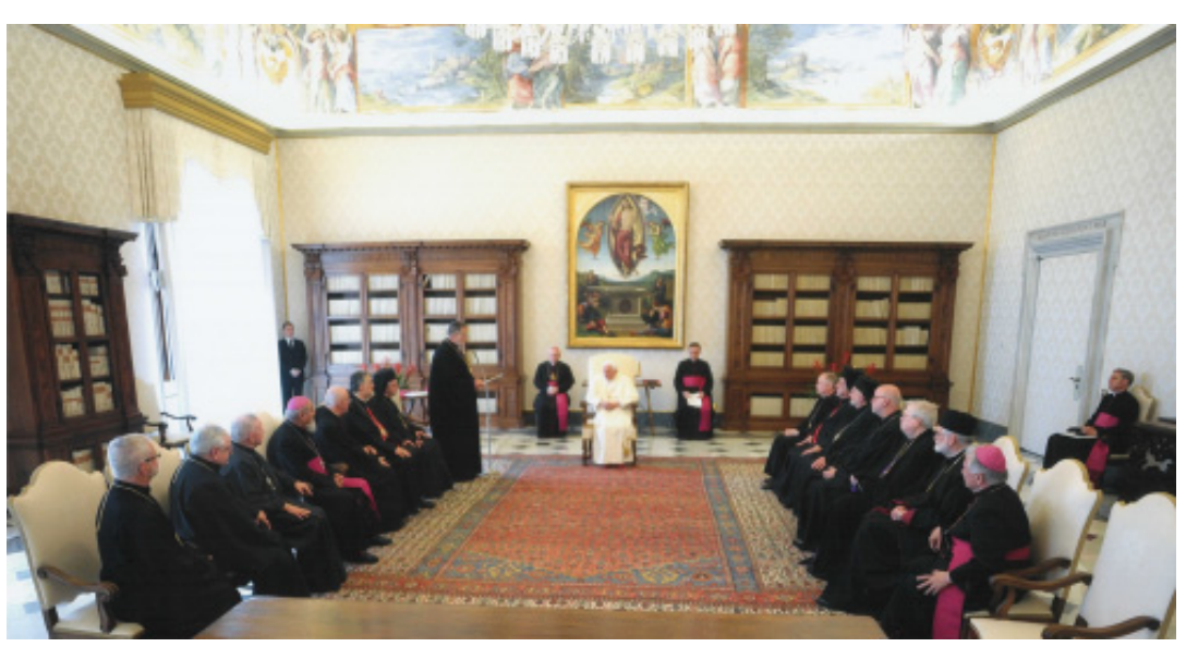
Metropolitan-Archbishop Stefan Soroka addresses Pope Benedict XVI.

Delivered in May, 2012 on behalf of the Eastern Catholic Hierarchs of Region XV of the United States Catholic Conference of Bishops by the Most