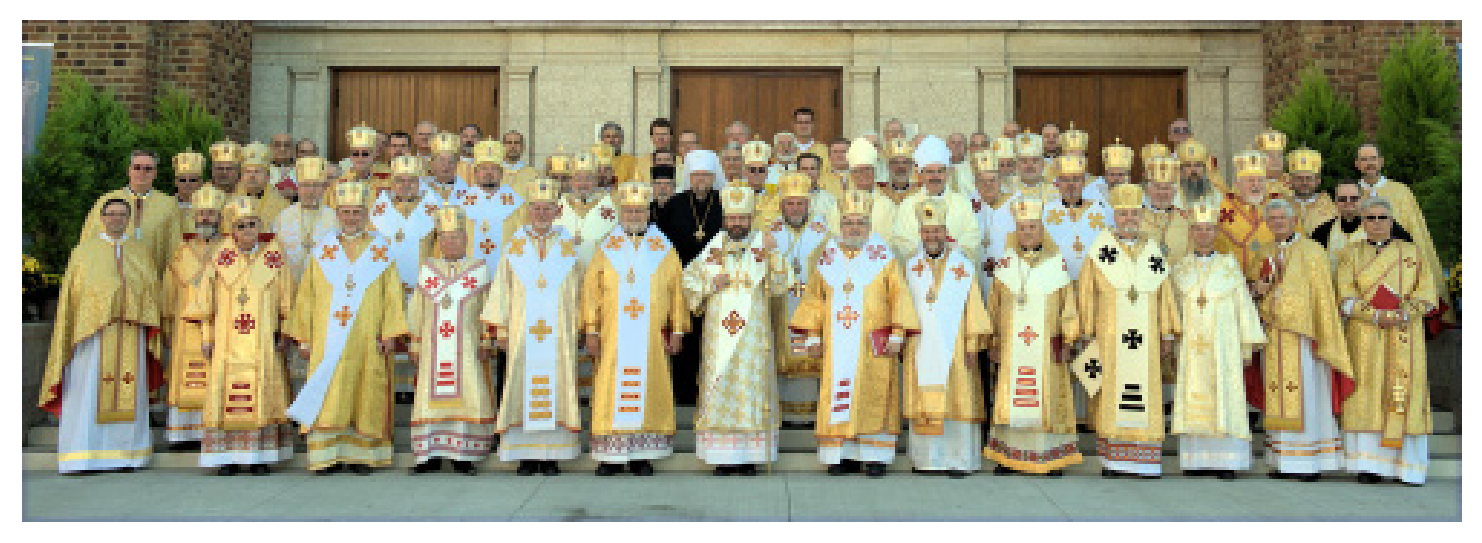
Photo of the Synod of Bishops of the Ukrainian Catholic Church (and clergy and guest Archbishops from the Ukrainian Orthodox and Roman Catholic Churches) standing before the Ss. Volodymyr & Olha Metropolitan Cathedral in Winnipeg, Canada, just prior to the opening Divine Liturgy by which the Synod formally began.

From the 9<sup>th</sup> to the 16<sup>th</sup> of September in the city of Winnipeg, Canada, the 2012 Synod of Bishops<sup>1</sup> of the Ukrainian Greek Catholic Church<sup>2</sup> took place in which participated 38 bishops from Ukraine,<sup>3</sup> USA, Canada. Australia. countries of central and western Europe and South America – includina emeritus bishops from Europe, the US, Canada and Argenting.