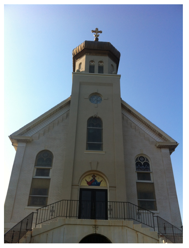
Front view of St. Vladimir Ukrainian Catholic Church, Palmerton, PA