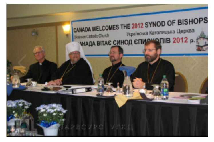
Photo from the Meeting of the Synod of Bishops.

The Synod expressed their thanks to Metropolitan Lawrence Huculak, and the Synod Organization Committee for their extensive preparation and exemplary organization of the Synod proceedings. The Synod Fathers expressed their heartfelt gratitude to all the People