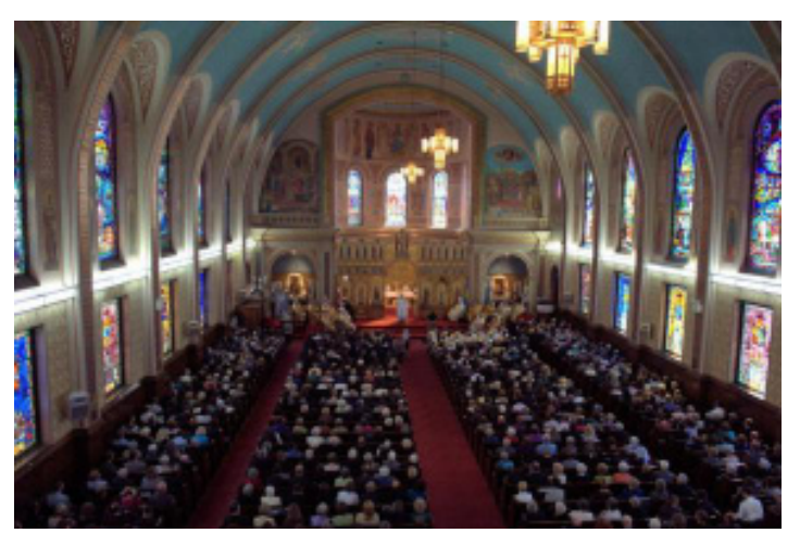
Ss. Volodymyr & Olha Metropolitan Cathedral.