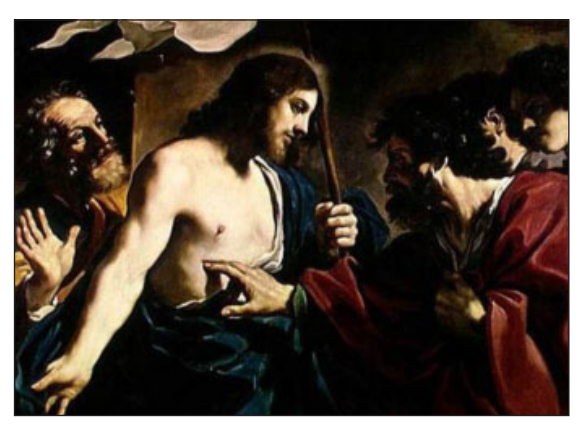
The Incredulity of Saint Thomas Giovanni Guercino