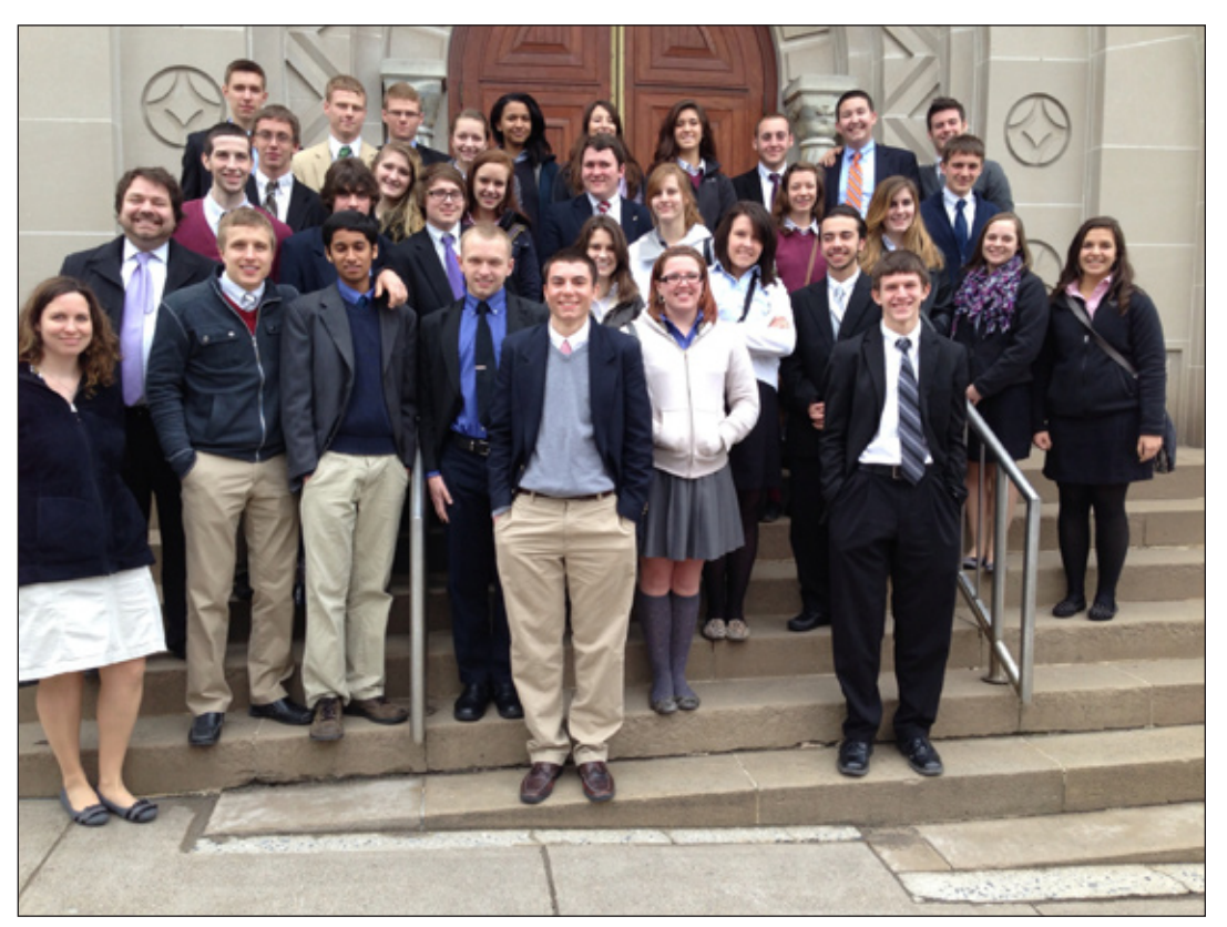
MMI Preparatory School visits the Replica of the Shroud of Turin.

Following several films and documentaries highlighting the history controversies and surrounding the Shroud of Turin, we proceeded to the nave of the church where the Shroud was on display for all pilarims. We were areeted by Msgr. Myron's brother, Demetrius, who araciously ushered us into the church to view and venerate the shroud. Msgr. Myron met our group of 40 - as well