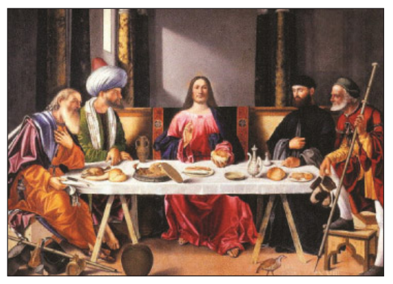
Supper at Emmaus Vittore Carpaccio

In the paintings and scriptures we have seen and heard the good news of the Resurrection was first spread to the apostles and disciples. It is now our turn to spread the word to our families, children and friends.