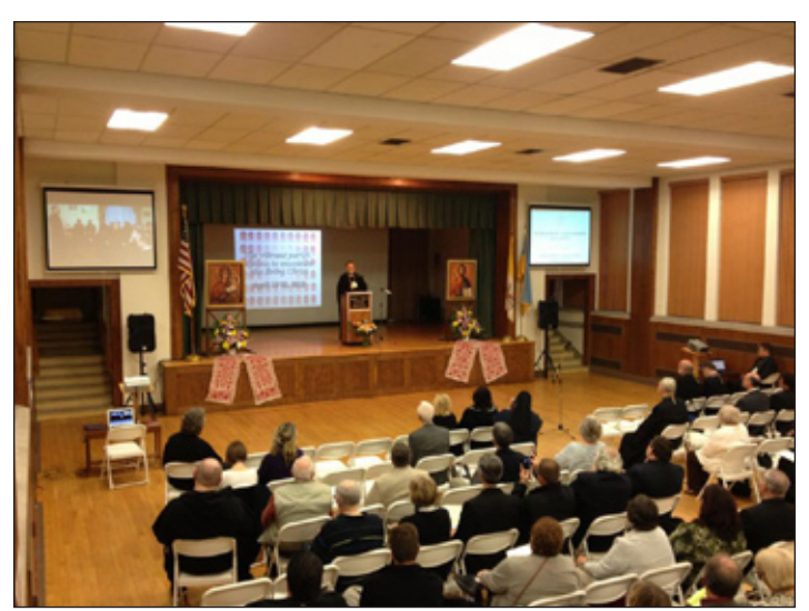
Stamford Eparchy Sobor