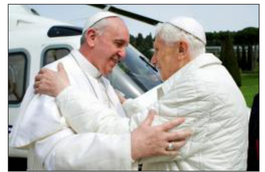
Pope Francis and Pope Emeritus Benedict XVI

Adapted from the article on http://en.radiovaticana.va