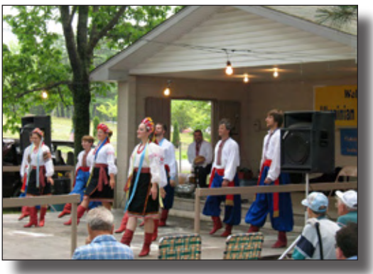
Kazka Ukrainian Folk Ensemble

We invite everyone from near and far to attend!