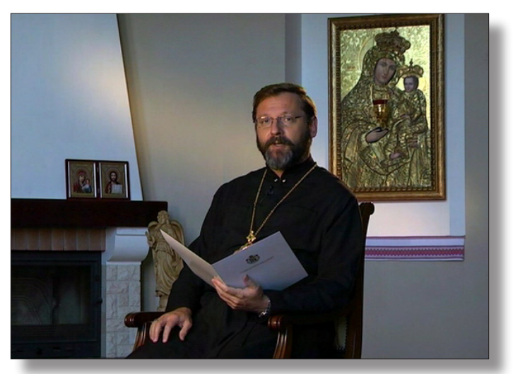
A video message from His Beatitude Sviatoslav Shevchuk was shown at the Knights of Columbus Convention.

We are strengthened and encouraged by the support offered to us by such esteemed Catholic institutions such as the international order of the Knights of Columbus. The cherished and practiced ideals of the Knights of Columbus, namely that of charity, unity, fraternity and patriotism,