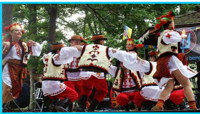
Voloshky Ukrainian Dance Ensemble (Philadelphia, PA)