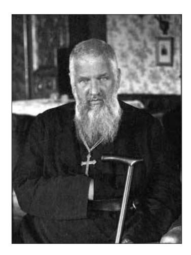
Metropolitan Andrey Sheptytsky