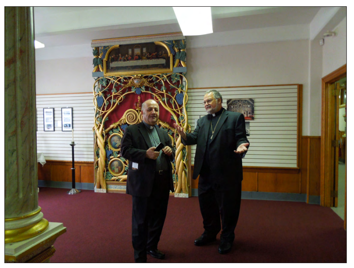
On a tour of the Treasury of Faith Museum.