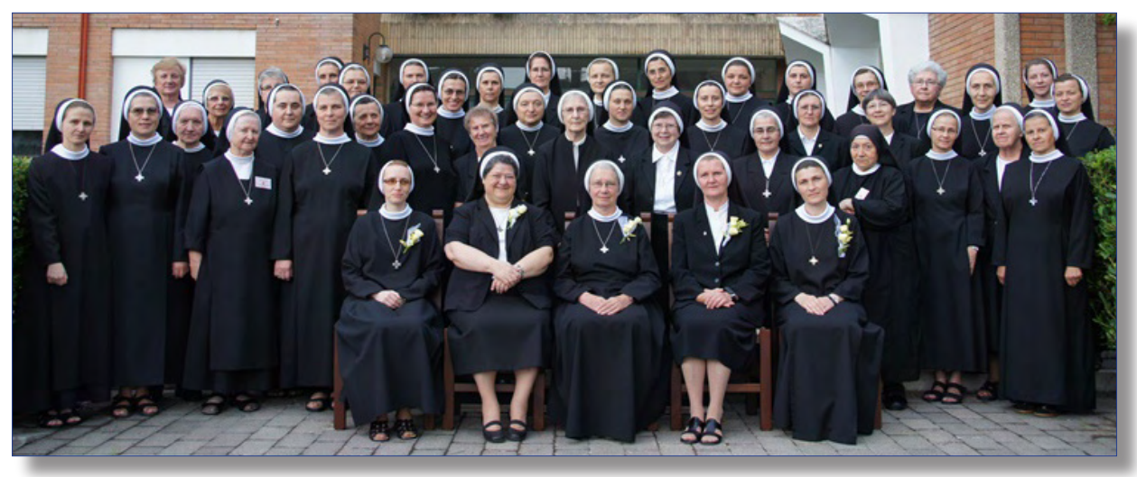
The Chapter body is pictured with the new Administration.

Adapted from the article on http:// www.ugcc.org.ua