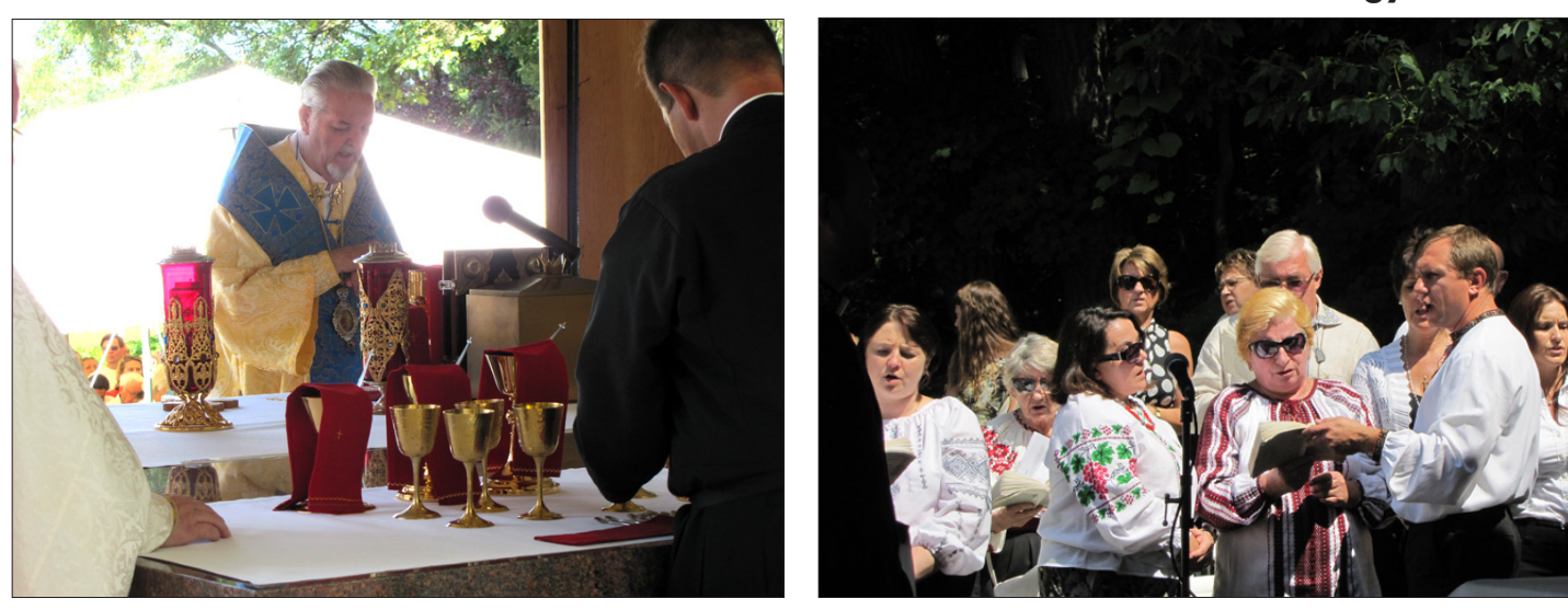
Watch a video from the pilgrimage on our blog at http://www.thewayukrainian.blogspot.com