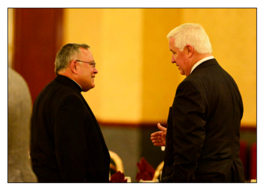
Archbishop Chaput and Governor Corbett

The biennial event was initiated by the State Council of the Knights of Columbus. Internationally, the Catholic fraternal organization promotes charity, unity, fraternity and patriotism while promoting and defending the Catholic faith.