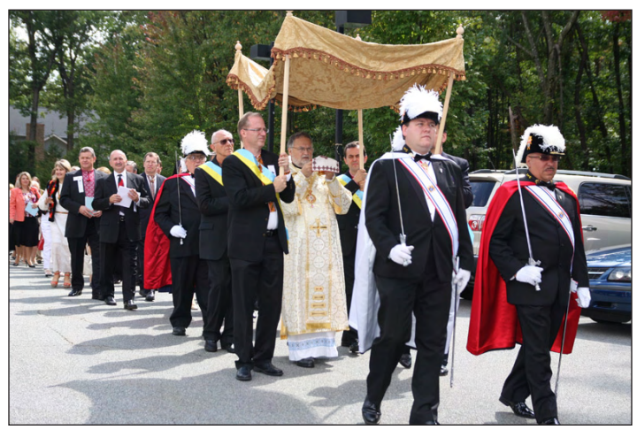
On Saturday, September 21, Metropolitan-Archbishop Stefan Soroka carried a discos with holy relics in a procession around the church to be consecrated.