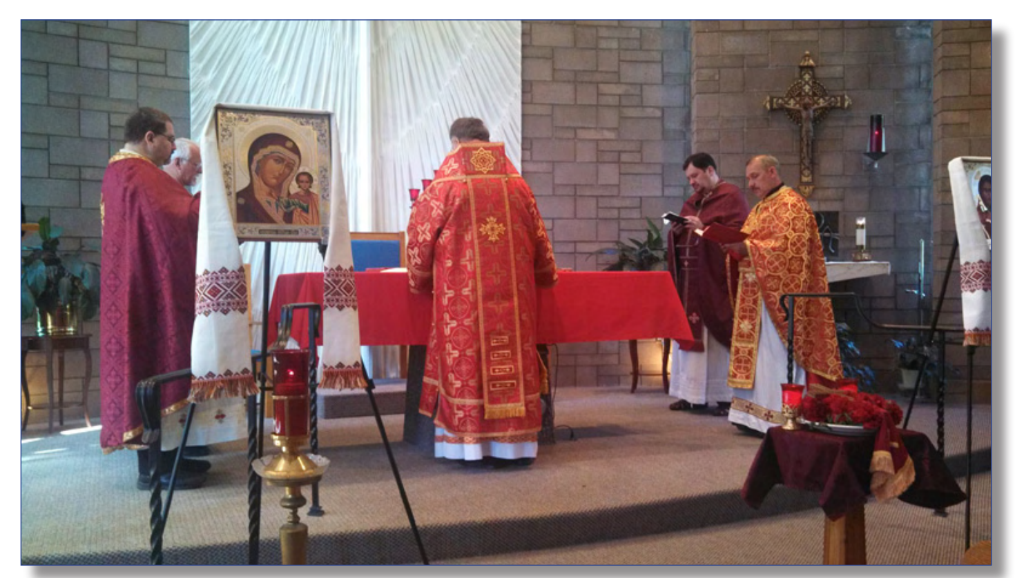
Divine Liturgy during the Annual Spiritual Retreat.