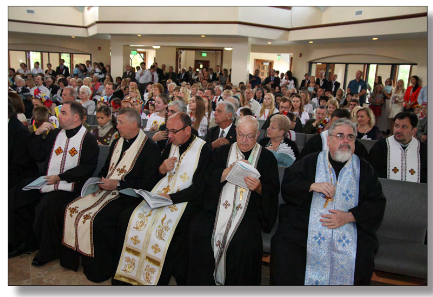
Faithful on September 21, 2013

Today, because of the recognition of his saintly life, and the spreading of the miraculous help of Bishop Velychkovsky