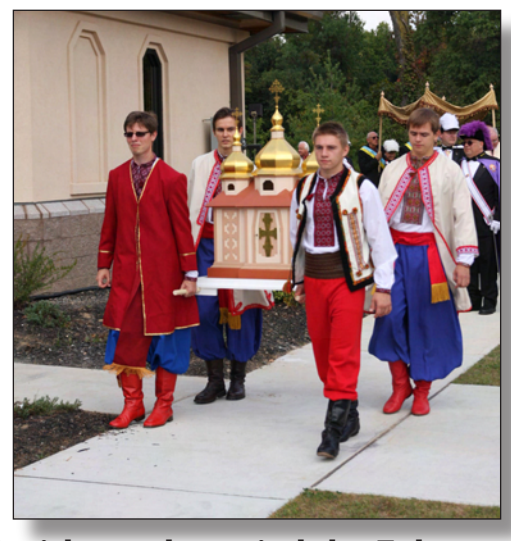
Parish youth carried the Tabernacle during the procession around the church three times.