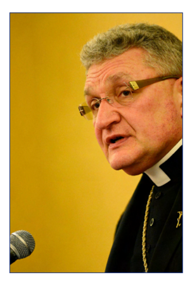
Pittsburgh Bishop David A. Zubik

As the public affairs agency for the Church Pennsylvania, the PCC formulates policy positions state on government programs, legislation and policies that affect the common good and the interests of the Church.