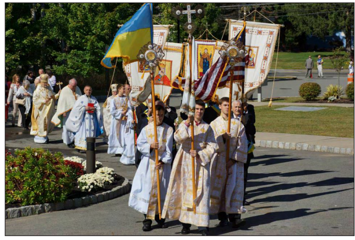
The first Divine Liturgy was celebrated on Sunday, September 22, 2013 at the newly consecrated St. John the Baptist Ukrainian Catholic Church in Whippany, NJ.