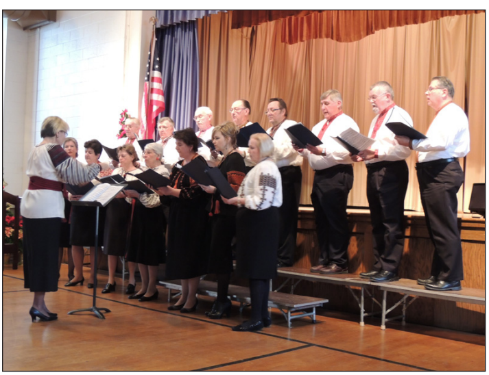
Choir: Annunciation of the Blessed Virgin Mary, Melrose Park, PA