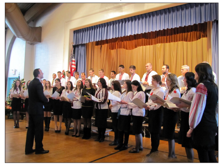
Youth Choir: Ukrainian Baptist Church Philadelphia, PA