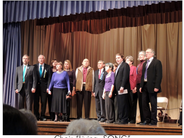
Choir "Living- SONG" Washington, DC