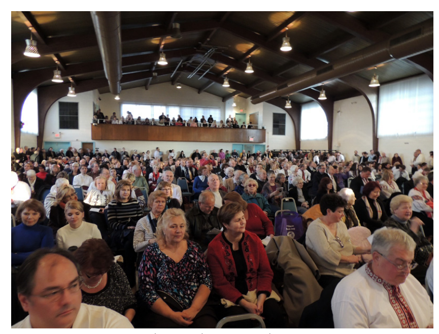
The Audience at the Cathedral Hall