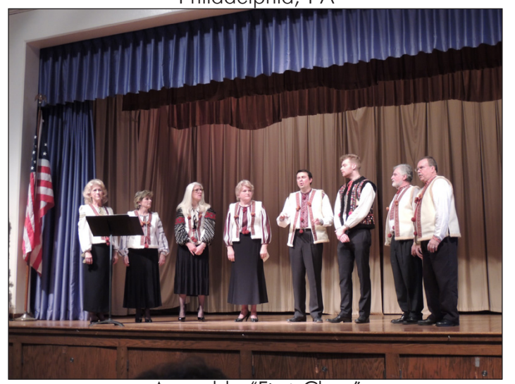
Assemble "First Class" Baltimore, MD