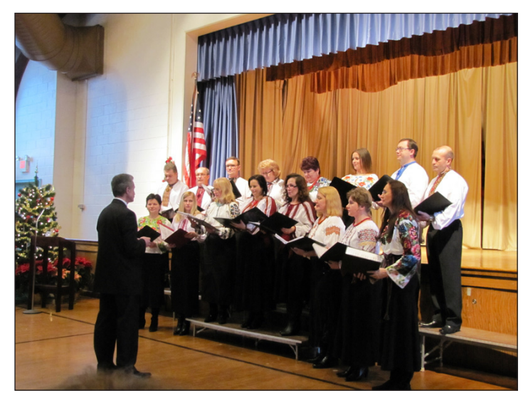
Chamber Choir "Accolade" Philadelphia, PA