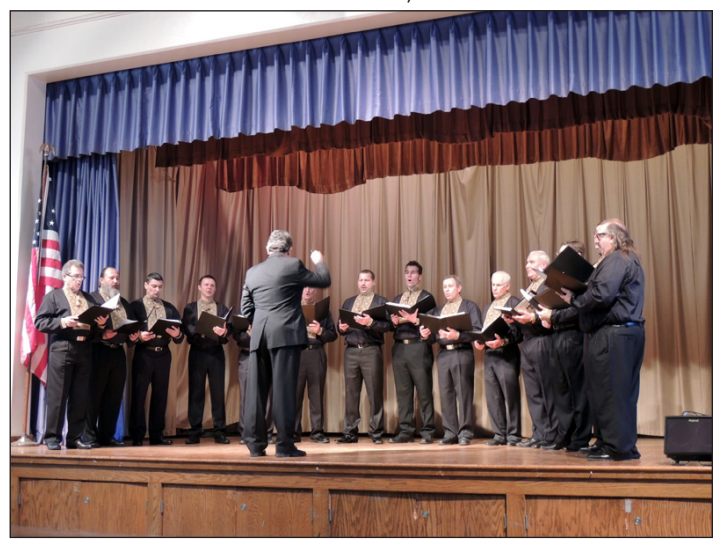
Male Choir: "Dzvin" Philadelphia, PA