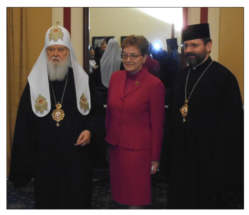
Photo: Patriarch Filaret, Representative Marcy Kaptur (D-Ohio), and Patriarch Sviatoslav.

Patriarch Sviatoslav said that all religious institutions of Ukraine support the people's quest for a more democratic government through constructive dialogue between the people and the government of Ukraine, but not through violence or aggression.