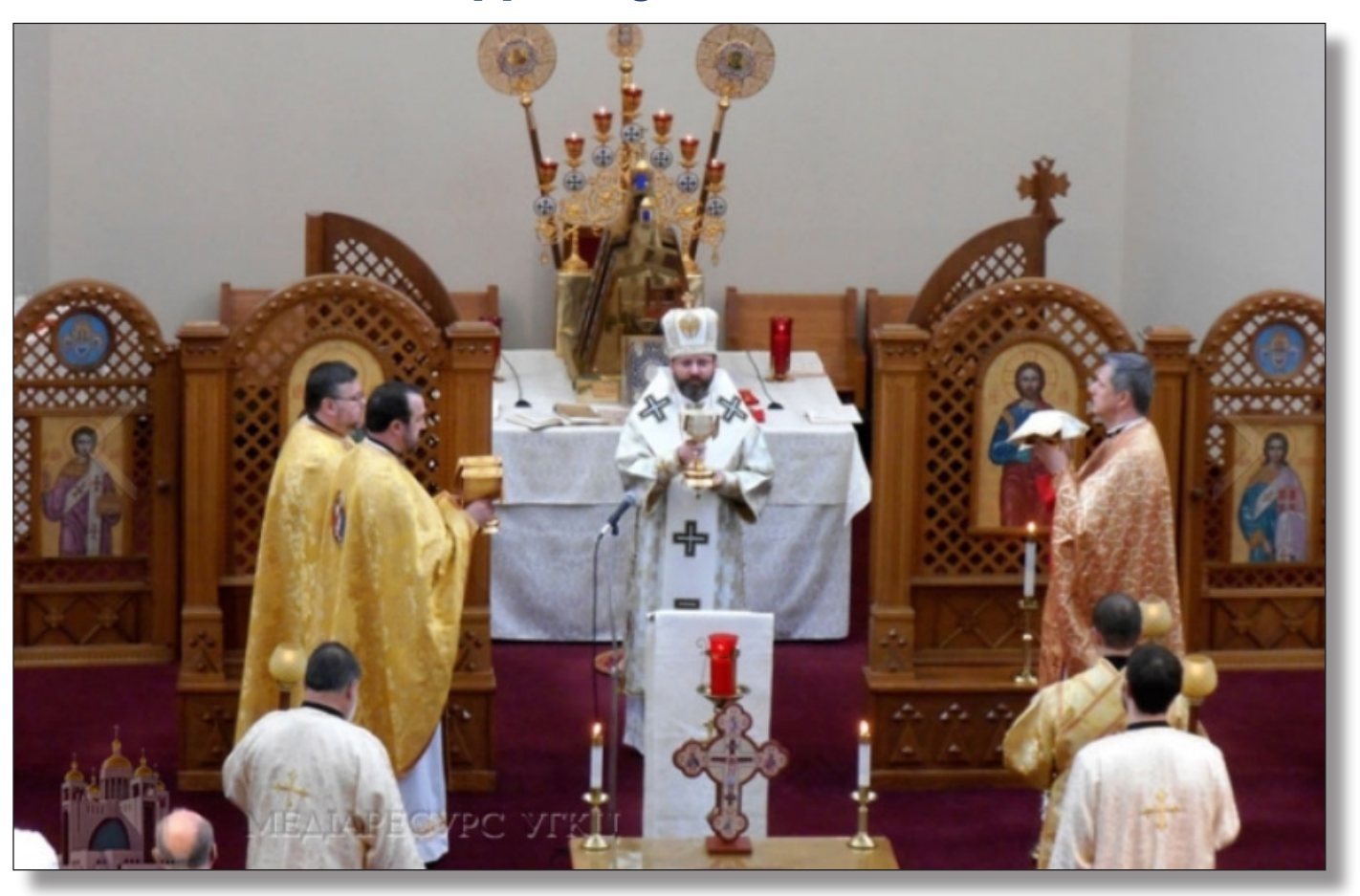
Major-Archbishop Sviatoslav Shevchuk at Ukrainian Catholic National Shrine of the Holy Family, Washington, DC, on February 9, 2014.