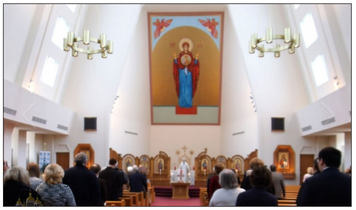
Ukrainian Catholic National Shrine of the Holy Family in Washington, DC.