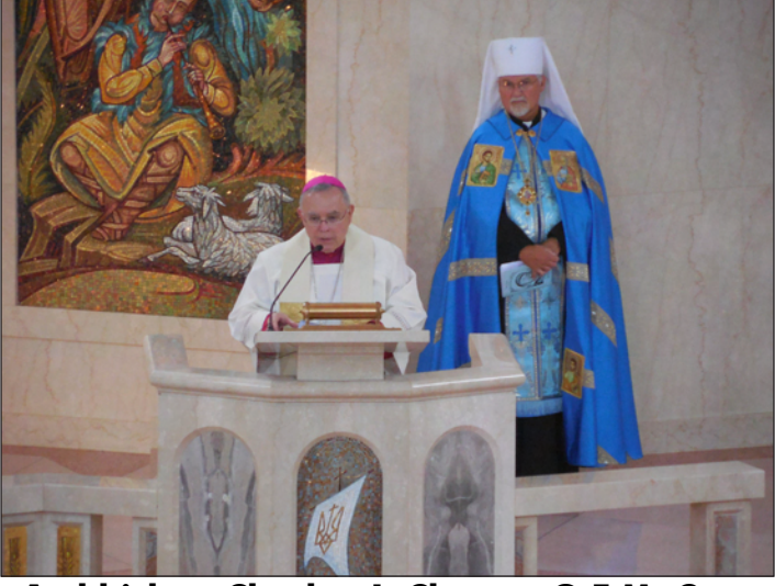
Archbishop Charles J. Chaput, O.F.M. Cap.