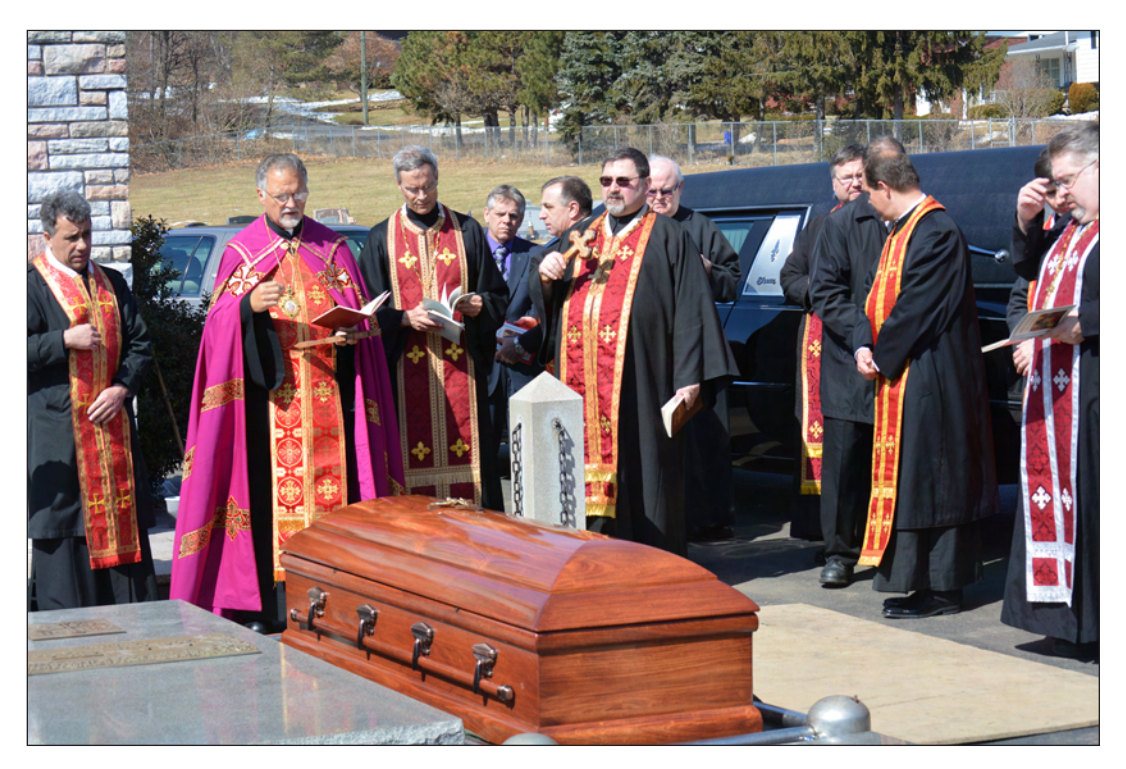
At the cemetery, a Panakhyda is prayed at the graveside.