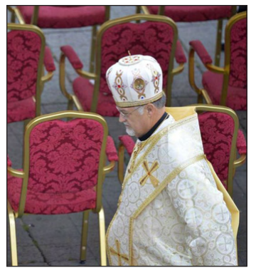
Metropolitan-Archbishop Stefan Soroka at St. Peter's Square on April 27, 2014.