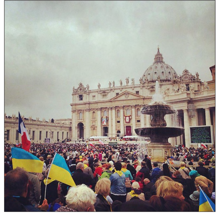
Ukrainian flags are seen in St. Peter's Square on April 27, 2014.

I personally met Pope John Paul II on a number of occasions. Especially I recall a lunch at his residence with eight other Eastern Catholic Bishops during the Special Synod on the theme of Bishops. Pope John Paul II showed such intense interest in the affairs of each of the Eastern Catholic Churches, and ensured that each of us were fully involved in the discussion, to the extent of even limiting one bishop who wanted to monopolize the discussion. Pope John Paul II looked upon people as individuals even amidst crowds. He expressed this saintly quality as did Blessed Mother Teresa of Calcutta whom he knew well. His unconditional service of the Lord and of His