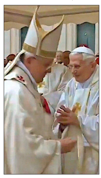
Pope After Francis (left) and Popeemeritus Benedict XVI embrace during the beginning the Holy Mass in St. Peter's Square, you can see Metropolitan-Archbishop Stefan Soroka standing among the Cardinals and Bishops in the center of the photo.