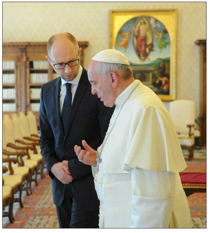
Prime Minister Arseniy Yatsenyuk and Pope Francis.

Adapted from an article on http://risu.org.ua