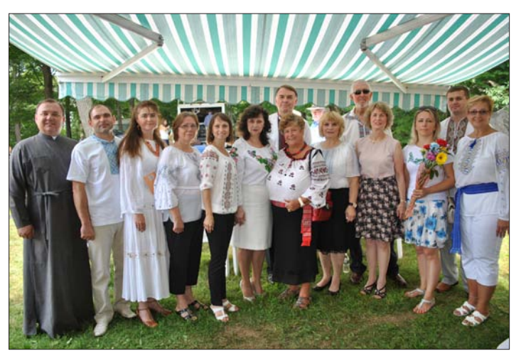
Choir from Passaic, NJ.