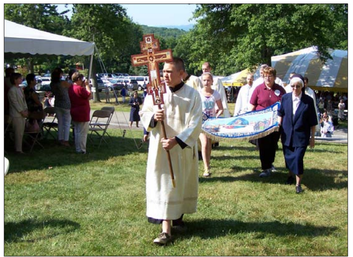
Procession during the Liturgy on Sunday, August 10, 2014.