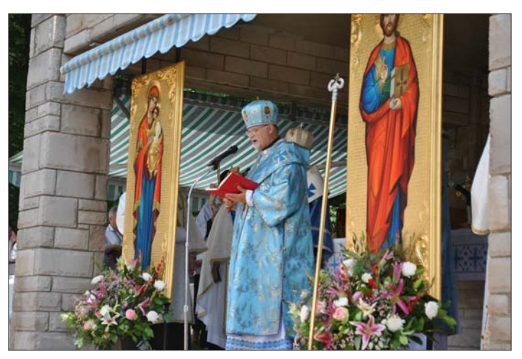
Metropolitan-Archbishop Stefan Soroka