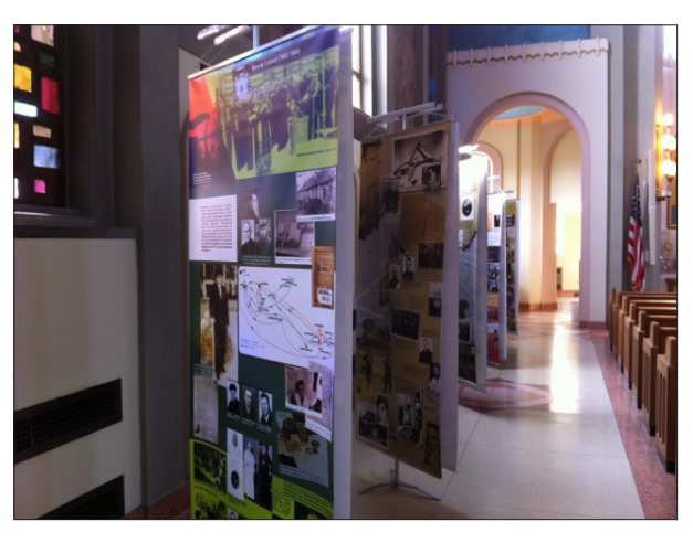
Symposium Posters

What is their message to you and to me today? We are humbled by their sacrifice, even sacrifice of life itself that faith may persevere for you and for me. Our hearts are filled with gratitude for their unconditional love for God and for our Ukrainian Catholic Church. We are encouraged by their example of love and sacrifice. We marvel at their stamina in continuing to endure their sufferings and yet live with hope. They teach us to be positive. They show us how