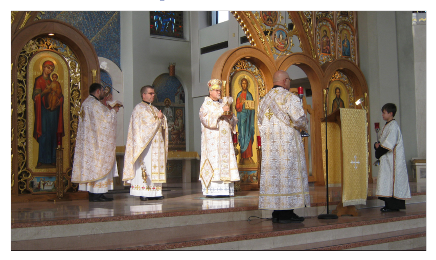
Liturgy at the Cathedral.

Today we gather to commemorate the legalization of the Ukrainian Greek Catholic Church in Ukraine. For forty-three years, this Church of holy martyrs functioned and grew vibrantly underground. It was forbidden to celebrate any Liturgies, even forbidden to have a funeral procession. Bishops, priests and religious functioned secretly while fulfilling assigned jobs in society. People received the Holy Sacraments secretly. Faithful could lose their jobs and could be arrested if found to be celebrating their faith. Many bishops,