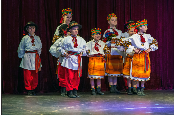
Pictures from St. Josaphat's 100th Jubilee Banquet at the Ukrainian Educational & Cultural Center, Jenkintown. Among the performances were Prometheus Ukrainian Male Chorus and "Vesna" Dance Ensemble of the local CYM Branch.