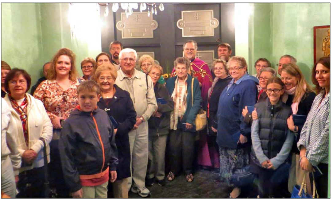
Panachyda at the Crypt in the Ukrainian Catholic Cathedral of the Immaculate Conception in Philadelphia on Saturday morning.