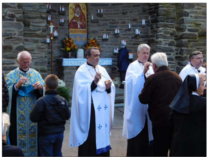
Anointing of the Faithful after the Moleben.