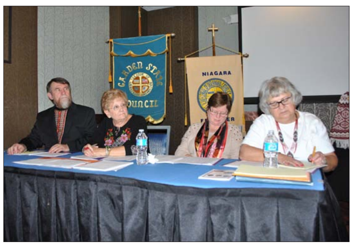
LUC National Board Meeting