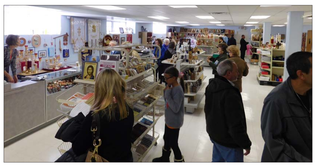
LUC at the Byzantine Church Supplies store on the grounds of the Cathedral in Philadelphia on Saturday morning.

City of Philadelphia; the Jesuit Church of the Gesu. Though no longer functioning as a parish church, it is now primarily used only on special