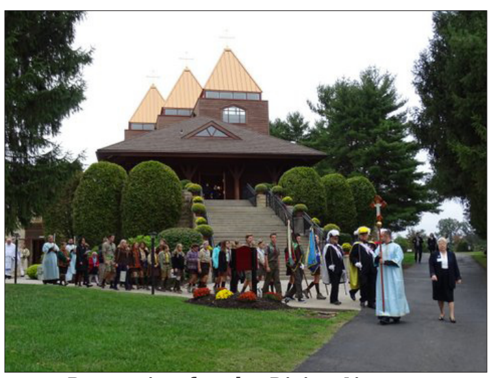
Procession for the Divine Liturgy.