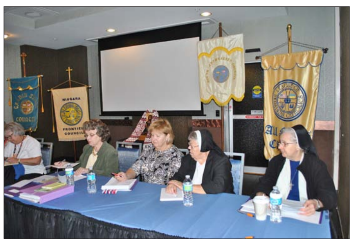
LUC National Board Meeting