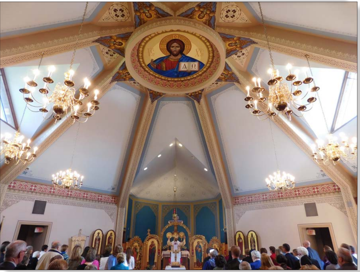
Watch a video from the Divine Liturgy on our YouTube Channel. https://www.youtube.com/user/thewayukrainian