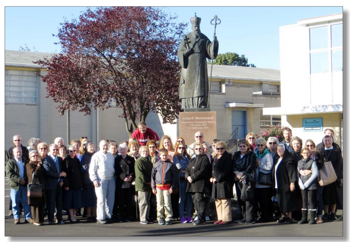
LUC Mobile Workshop participants pose by the statue of Venerable Metropolitan Andrew Sheptytsky on the grounds of the Ukrainian Catholic Cathedral of the Immaculate Conception in Philadelphia on Saturday morning.