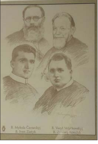
Sketches of Ukrainian Redemptorist Martyrs on display at St. Peter the Apostle parish.