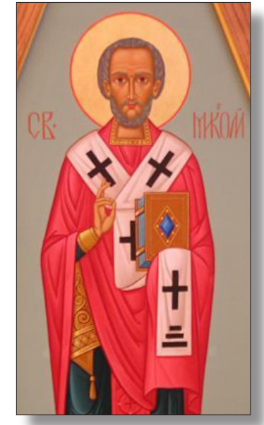
Icon: St. Nicholas Ukrainian Catholic Church, Philadelphia

Raising His eyes toward His disciples the Lord said: "Blessed are you poor, for the Kingdom of God is yours. Blessed are you who are now hungry, for you will be satisfied. Blessed are you who are now weeping. For you will laugh. Blessed are you when people hate you, and when they exclude and insult you, and denounce your name as evil on account of the Son of Man. Rejoice and be glad for your reward will be great in heaven.