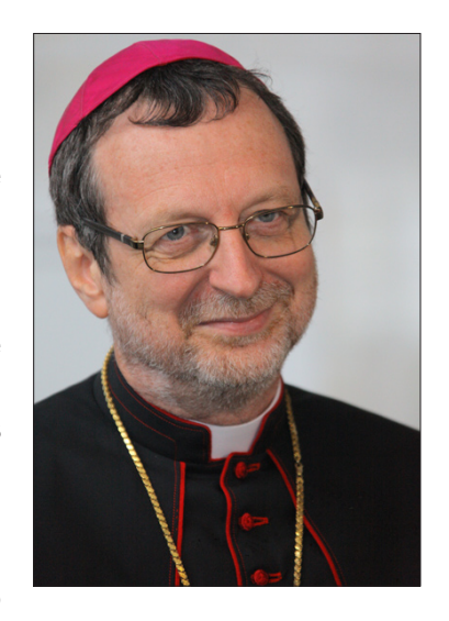
New Apostolic Nuncio in Ukraine

http://www.nuntiatura.kiev.ua/nuncio.files/nuncio eng.htm