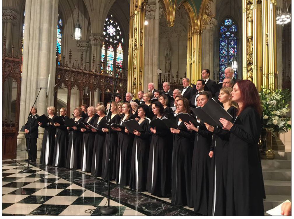
Dumka choir